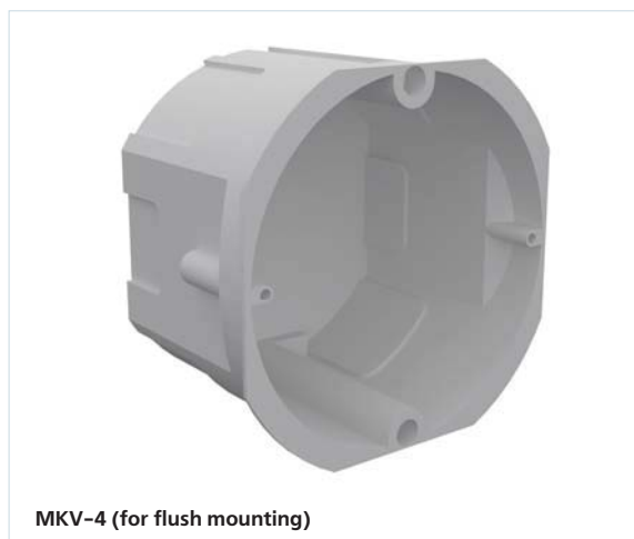
MKV-4 (for flush mounting)