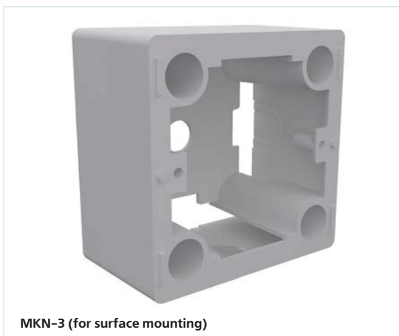
MKN-3 (for surface mounting)